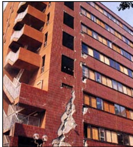
Figure 3: Concrete wall failing in shear in the 1995 Kobe earthquake. Capacity design aims to protect against such a failure mode.

These detailed capacity-design requirements, such as dynamic shear amplification factors, are still useful, particularly for regular structures less than 20 stories and for the preliminary design of taller structures. Today, thanks to recent advances and availability in structural analysis soft-