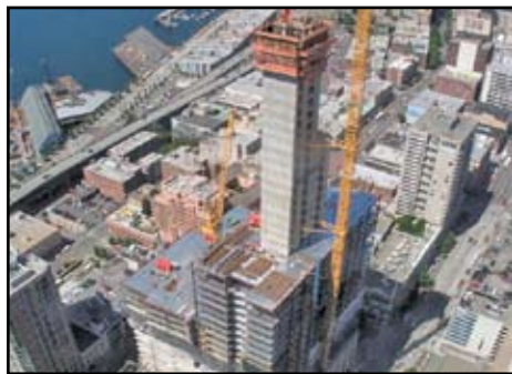
Figure 1: Concrete core-wall building under construction, the Washington Mutual/Seattle Art Museum, Magnusson Klemencic Associates, Structural Engineers.

In high seismic zones, prescriptive provisions of U.S. building codes do not permit the core-wall